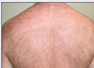
Full back before Tx